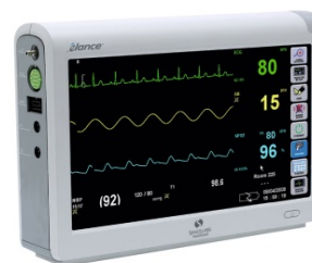
Elace Vital Signs Monitor 93300