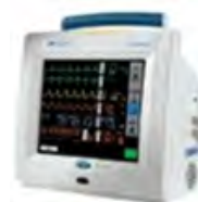
Ultraview SL 2200 (2005)