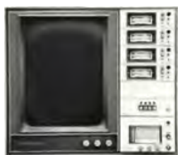
21" Oscilloscope (1968)

EMEA Region including Australia, New Zealand, and Pacific Islands