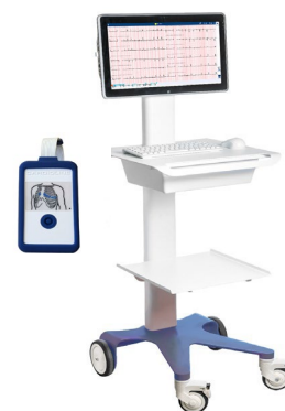
Cardioline Touch ECG HD+