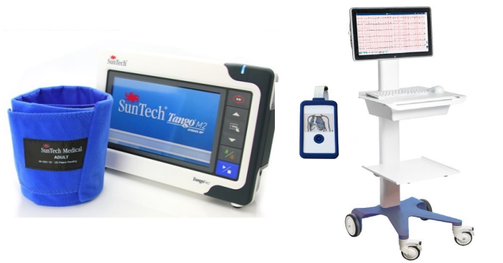
Suntech Tango M2