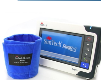
Suntech Tango M2